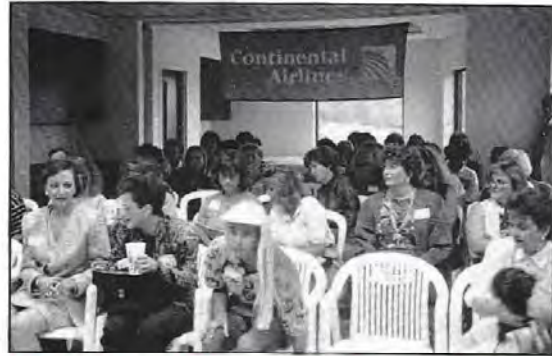
Gathering for their EWG orientation are 45 Dallas businesswomen ready to hit the links!