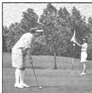
Dunning - The Fashion Plate