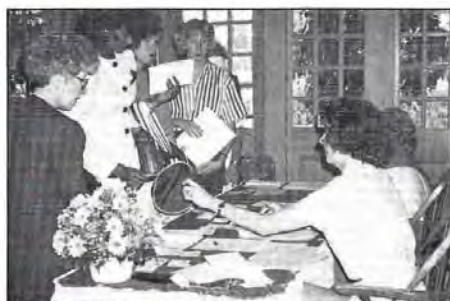
The Sign-Up Line in Atlanta