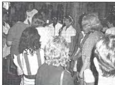
Once around the room with intros!