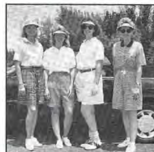
Who's the lucky one to drive it away?