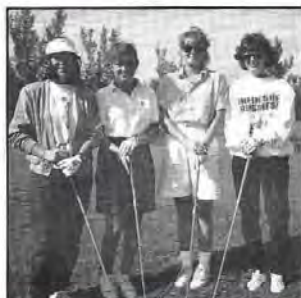
The Golden Bear Girls are at it again!