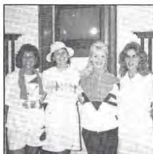
A Fashionable Foursome

Please send us photos of your chapter so we can include one in the next Gallery!