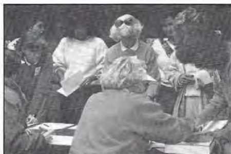
75 women line up four deep in Cleveland