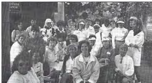
A lively gathering at Jupiter Dunes.